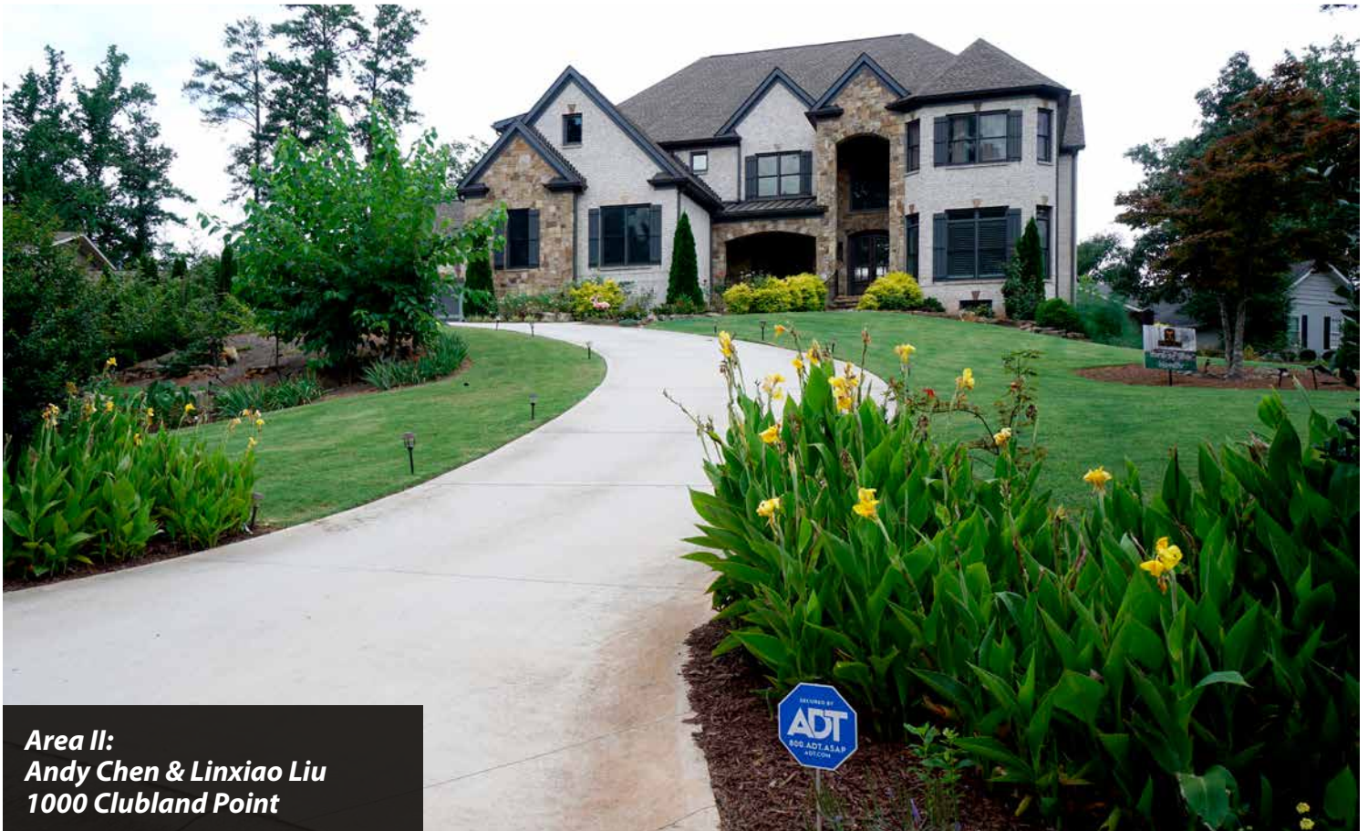
Area II: Andy Chen & Linxiao Liu 1000 Clubland Point