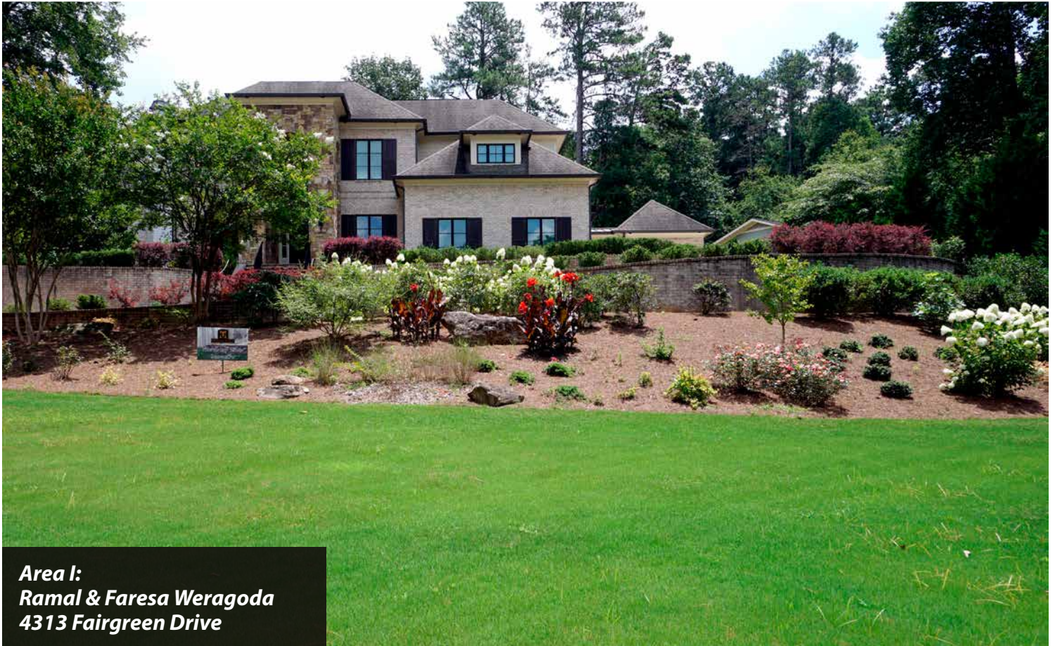
Area I: Ramal & Faresa Weragoda 4313 Fairgreen Drive