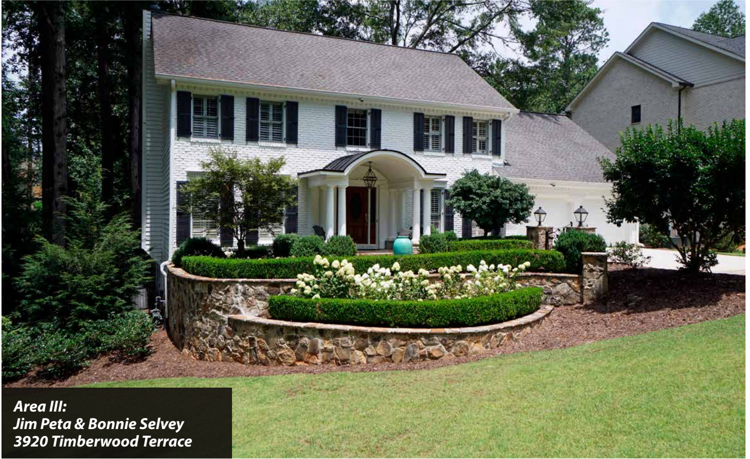
Area III: Jim Peta & Bonnie Selvey 3920 Timberwood Terrace